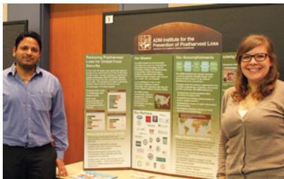
2015 Public Engagement Symposium

The campus and community have the opportunity to learn about and share information regarding scholarly and creative community engagement efforts.