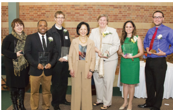
2015 CAEPE Winners

Public Engagement recognizes faculty, academic professionals and students who engage the public to address critical societal issues. Recipients have consistently applied their knowledge and expertise to make a difference in their community, country and world.