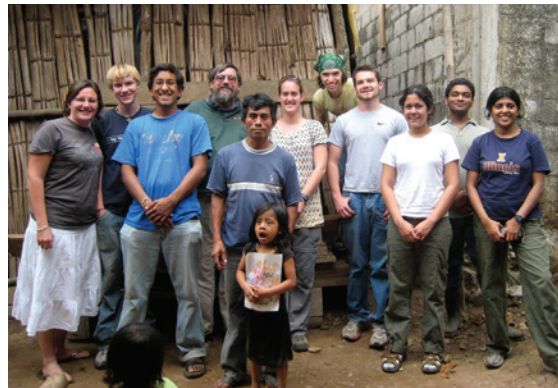
Engineers Without Borders: ewb-usa.uiuc.org